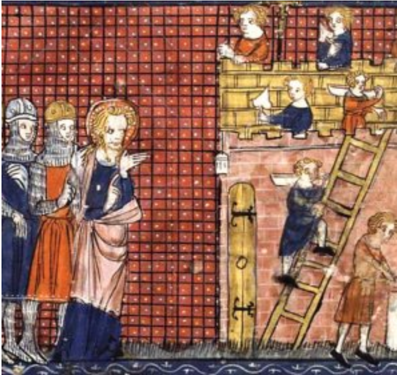
Saint Valentine of Terni with his disciples, from a 14th century French manuscript