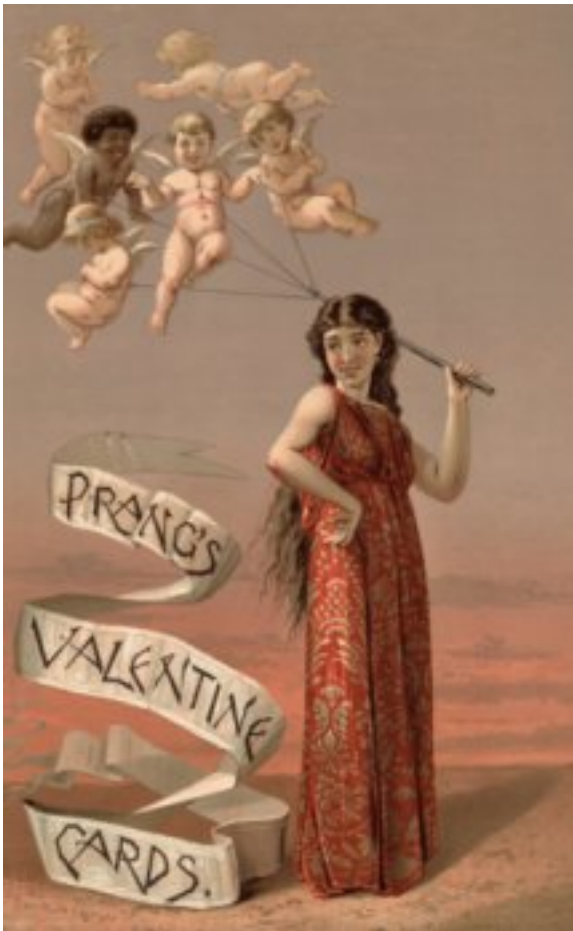
An 1883 advertisement for Prang's Valentine's cards

The 'Catholic Encyclopaedia' associates a third saint Valentine with 14 February. The only thing k